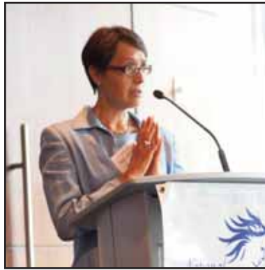
Associate Judge of the NYS Court of Appeals Hon. Jenny Rivera